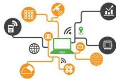
Figure 1: Internet of Things (IOT)

The Internet of things (IoT) is the network of physical devices, vehicles, home appliances, and other items embedded with electronics, software, sensors, actuators, and connectivity which enables these things to connect, collect and exchange data. IoT involves extending Internet connectivity beyond standard devices, such as desktops, laptops, smartphones and tablets, to any range of traditionally dumb or non-internet-enabled physical devices and everyday objects. Embedded with technology, these devices can communicate and interact over the Internet, and they can be remotely monitored and controlled. With the arrival of driverless vehicles, a branch of IoT, i.e. the Internet of Vehicle starts to gain more attention.