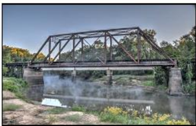
Fig.2 Howe Truss Bridge