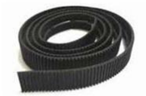
Figure 6 belt