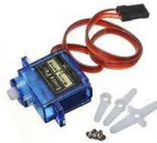
Figure 9 SG90 servo motor

The sorting mechanism uses an SG90 servo motor :