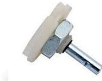
Figure 8 dummy motor

The slow speed ensures accurate detection and sorting.