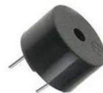
Figure 11 5V buzzer