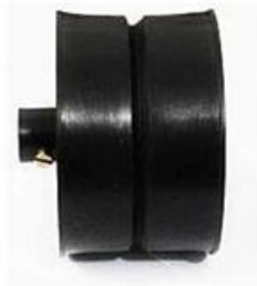
Figure 5 Pulley wheels