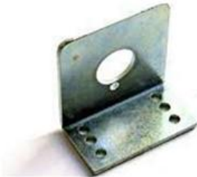
Figure 7 L-clamps