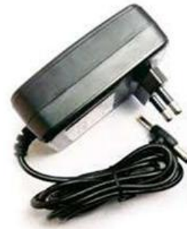
Figure 2 Power Supply

The system uses a 12V 1A adapter as the main power source. A DC buck converter is used to step down the voltage to 5V required for the Arduino Nano, sensors, LCD, and servo motor. This ensures stable and regulated power supply.