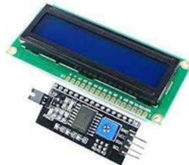
Figure 10 16x2 LCD display

A 16x2 LCD display with I2C module is used: