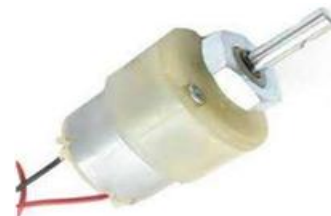
Figure 4 10 RPM DC gear motor