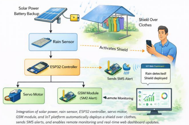
Fig 1.3 Implementation Architecture of Solar-Powered Smart Rain Shield with SMS Alert and Web Monitoring.

Simultaneously, the IoT platform updates real-time data on a web dashboard, allowing users to remotely monitor rain status, shield position, battery level, and overall system condition from any location. The integration of solar power with battery backup ensures uninterrupted operation even during power outages.