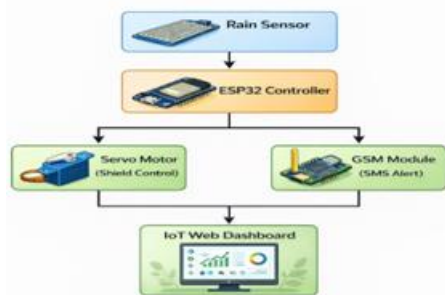
Fig1.1 GSM and IoT Enabled Smart Rain Shield System.

Feature selection in the proposed system focuses on identifying essential parameters required for accurate rain detection and automated shield control. The primary features include rain intensity data from the rain sensor , shield position status , power supply level , and battery backup condition . These features are selected to ensure reliable environmental monitoring, efficient decision-making by the ESP32 microcontroller, and real-time user communication through GSM and IoT platforms. Selecting these relevant features improves system responsiveness, reduces unnecessary processing, and enhances overall performance.