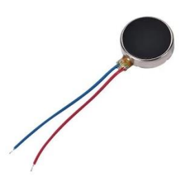
Fig 3. VIBRATION MOTOR

Vibration motors aligned on the arm will trigger when the sensors surface force is detected. They activate their respective vibration motor at an intensity directly proportional to the amount of pressure applied by the user. This feedback allows the patient to help them identify and modulate their force application in a way that promotes better motor control and sensory awareness. This means that the varying degree vibration levels act as motivation for the patient to keep the right level of force so that the rehabilitation process will be much more fun and effective. Multiple vibration motors ensure localized feedback to specific muscle groups for neuromuscular recovery.