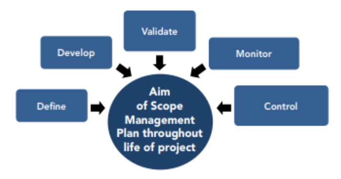
Fig 2. Plan scope management

The main input to this process is the project charter, and by using expert judgment in conjunction with project team meetings, the two main outputs are the Scope Manage ment Plan itself and the Requirements Management Plan. The inputs, tools and tech niques, and outputs of this process are summarized in the table below.