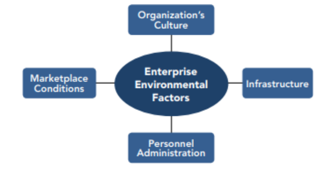
Fig 4. Enterprise Environmental Factors

These include the organization's culture, infrastructure, personnel administration, and marketplace conditions.