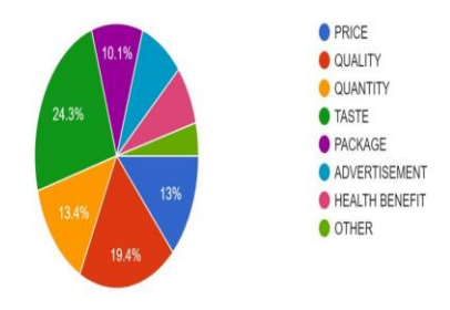
Chart :Factor influences to buy Britannia Bread

10.WHICH FACTOR INFLUENCES YOU TO BUY BRITANNIA BREAD: 100 responses