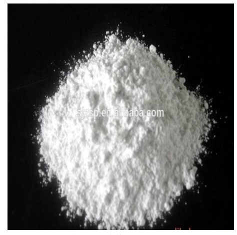
Fig 3.2 CSH powder

microstructure and reduce the water permeability of hardened concrete. Lin et al. demonstrated the impact of nS addition on porosity of eco-concrete. They have shown with a mercury porosimetry check that the relative porosity and pores sizes decrease with nS addition (1 and a couple of bwoc).