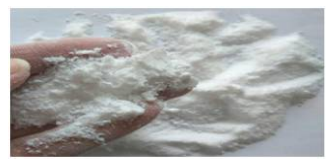
Fig 3.1: Nano silica material

Nano-materials are very small sized materials with particle size in nanometres. The small size of the particles also means a greater surface area. Since the rate of a pozzolanic reaction is proportional to the surface area available, a faster reaction can be achieved . Only a small percentage of cement can be replaced to achieve the desired results.