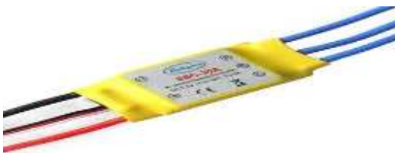
Fig.3 : ESC

It stands for the electronic speed controller and it is used to vary the servo motor speed , its direction and also for applying the brakes . for our application we are using the 30 A rating ESC . we decided this as per motors , battery and propeller specifications .