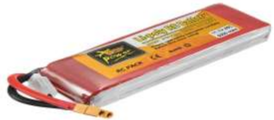
Fig.5 : Li-po Battery

For our application as per the motor rating we are using 6500 mAh battery . cause this battery can give us a better flight time to fulfil the work proposed.