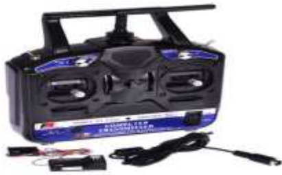
Fig.7 : FlySky CT6B Transmitter