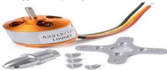
Fig.2 : BLDC Motor

Brushless DC Motors do not possess brushes, they have a permanent magnet . Its movements can be controlled via an electronic controller and speed feedback mechanism. These motors are energy saving as compared to the brushed dc motors. For our application we used the 1000 Kv rating motor which gives us approximately 980 gms thrust .