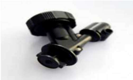
Fig.8 : Nozzle

The nozzle is a device with varying cross section area to control the flow of the fluid, direction, shape . In the nozzle the velocity of fluid increase due to pressure energy.