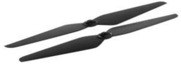
Fig.4 : Propeller

As per the frame size and motor rating the propeller should be selected . In this current scenario our frame size is about 480 mm . So the propeller size selected is about 8" , 9" , 10" . But we selected 9" size propeller .