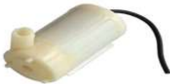
Fig.8 : 9V pump

As per required flow velocity the 9V dc power supplied water submersible pump is used for spraying the pesticide through the nozzle.