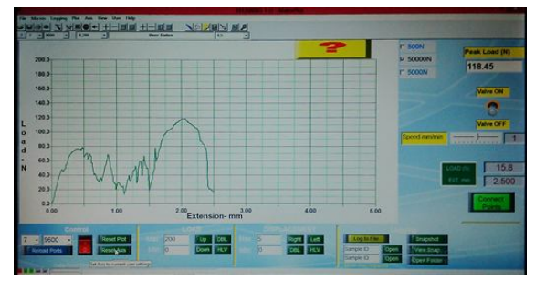
Figure 7: Graph between Extensions per mm vs Load for Composite with Sugarcane Husk

(b) Biodegradable composite with sugarcane Husk