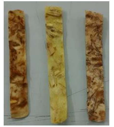
Figure 4: Samples as per the ASTM standards

Specimen size: The most common specimen for ASTM D-638 is a Type "I" tensile bar but test was performed on 20x100x4mm rectangular bar because further machining on sample could lead to sample failure.