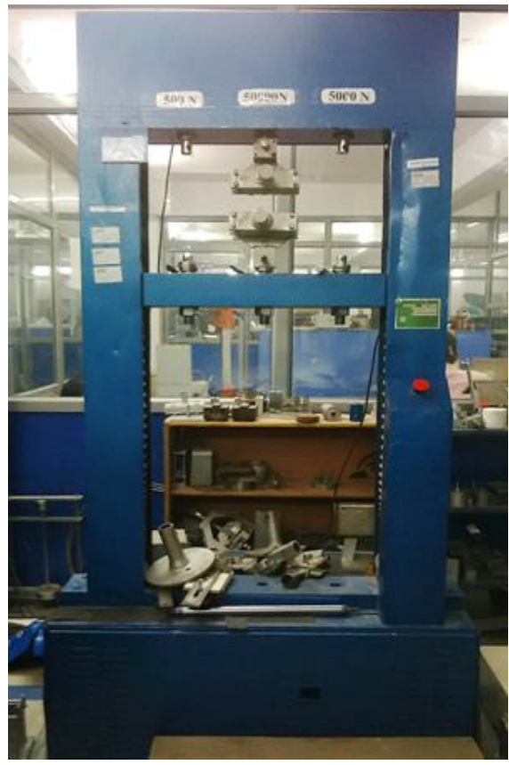
Figure 3: Ultimate Tensile Strength Machine

One of the properties can determine about a material is its ultimate tensile strength (UTS). This is the maximum load the specimen sustains during the test. The UTS may or may not equate to the strength at break. This all depends on what type of material is testing . . . brittle, ductile or a substance that even exhibits both properties. And sometimes a material may be ductile when tested in a lab, but, when placed in service and exposed to extreme cold temperatures; it may transition to brittle behavior.