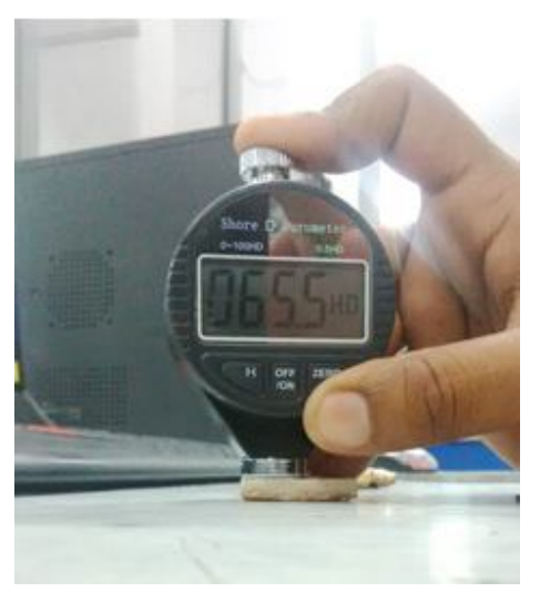
Figure 1: While performing Shore D hardness Test