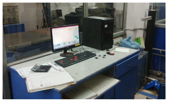
Figure 9: Workstation at Spectro for tensile testing machine