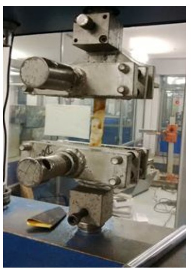
Figure 6: Sample during Tensile Test

(b) Biodegradable composite with sugarcane Husk