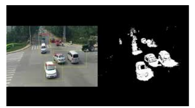
Fig. 1 – Detection and tracking of moving objects in a video surveillance video

• Efficient way for an offline search and retrieval of relevant data. In general, a surveillance system must be able to detect the presence of objects moving in its field of view, track these objects over time, classify them into various categories, and detect some of their activities (see Fig. 1). It should also be capable of generating a description of the events happening within its field of view.