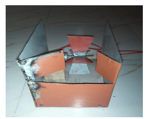
Fig. 4 Photograph of Actual Model (F.V)

When vehicle start to work, due to motion of vehicle wind will induced, the induced wind is channelled in the direction of blades through channel which is made in casing. If the wind is properly directed towards the wind turbine blades, optimum electricity will be generated.