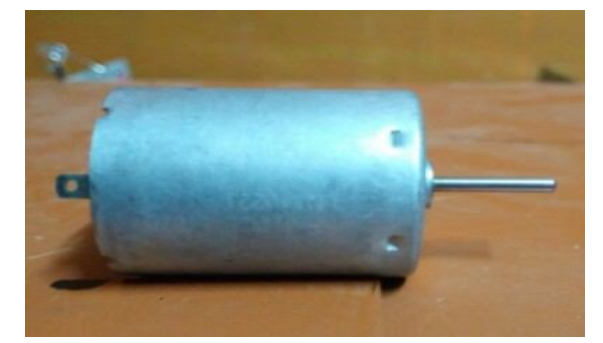
Fig.1 Photograph of Dynamo

Efficient generator/dynamo for model is very important, the factor affecting on selection of generator/dynamo are Cost, weight, size, torque, obtained power and application. The PMSG have mechanically lower rotational speed. This means that the PMSG has a higher number of poles. Magnets used in PMSGs have a major impact on the performance of PMSGs.