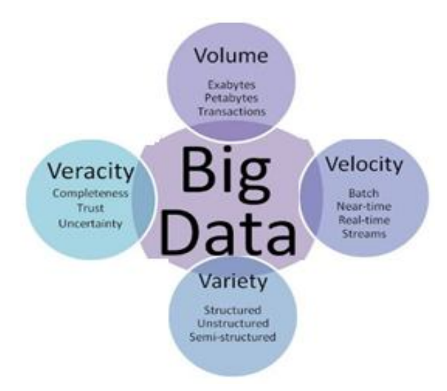
Fig 1: Big Data Characteristics

One of the commonly used models for explaining big data is the multi-V model. Figure 1 illustrates the multi-V model. Some of the Vs used to characterize big data include variety, volume, velocity, veracity and value [2]. The different types of data available on a dataset determine variety while the rate at which data is produced determines velocity. Predictably, the size of data is called volume. The two additional characteristics, veracity and value, indicate data reliability and worth with respect to big data exploitation, respectively.