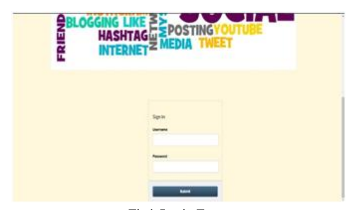
Fig4. Login Form