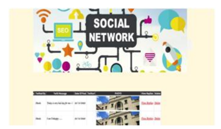
Fig6. Identified Users Dashboard

The Stress Users Dashboard Module is a interface that is meticulously crafted to offer administrators real-time insights and comprehensive control over user stress level activities within the platform. Serving as the prominent visualization to access user mental state, this module facilitates the monitoring of suicide ideation, user management, and fosters a well transparent and safe social network environment.