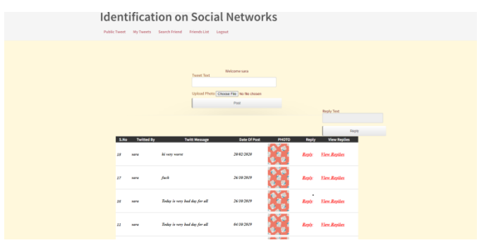
Fig5. Post Uploading