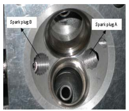
Fig: View of cylinder head with provision for twin plug

The arrangements of spark plug were conducted on a four-stroke air cooled petrol engine with necessary modifications to accommodate dual plugs. The fins over the engine dissipate heat to the surrounding air, thus preventing the overheating of the engine. A fan is provided to blow air over the engine fins for effective cooling. The inlet and exhaust valves are operated by cam shaft driven by crank shaft. The engine specifications apart from the original spark plug 'A', whose diameter is 14mm, one more 14mm hole is threaded in the engine cylinder head diametrically opposite to it, to fit the second spark plug 'B'.