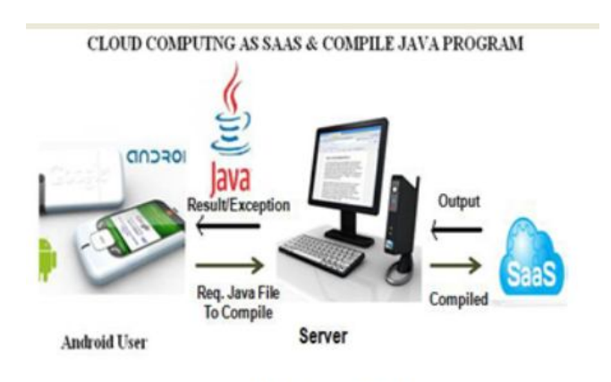
figl. System Architecture