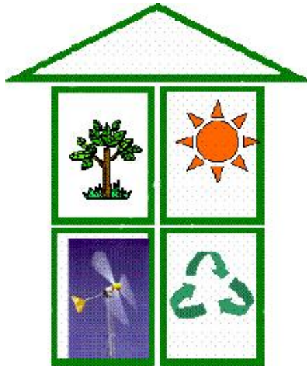
Figure: Green building factors