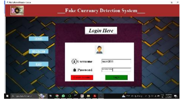
Fig 4login page

B. Software Login interface: In this login interface we can see rushi can login. If the username are correctthen it will login and show the pop up of login successfully. It takes username and password for login