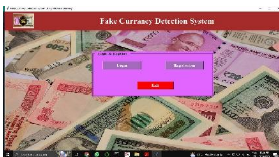
Fig 3 home page

A. Software Login and Register interface : This part of the system gives the to convenient way to register and login himself.