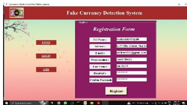
Fig 4 registration page