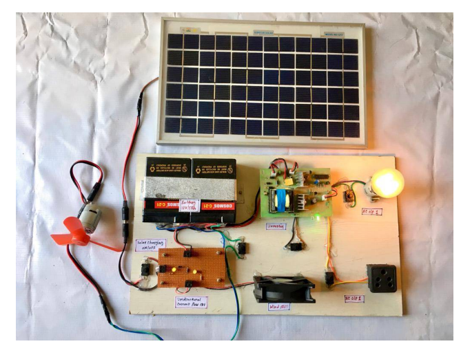
Fig.4 Model of Hybrid Power Plant

This paper shows how to implement the Electric Solar- Wind Hybrid power plant to generate the clean and cheap cost energy from the non-conventional energy resources that is solar energy and wind energy.