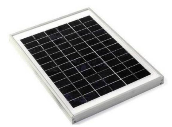
Fig.1 Solar Panel

Solar Panel: Solar panels are photovoltaic which generates electrical energy using sun light radiations. Depending on the position and intensity of the sun radiation the amount of electrical DC energy will produced. For the proposed system specifications and design, a 12V, 150 watt off grid solar panel is used.