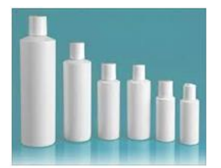
Fig. 1 High-density polyethylene bottles

Our project main purpose is that to reduce plastic pollution which is adversely affecting human being and overall society which it is causing harmful and health issues to human beings and there is effect on environment as well it plays a vital role.