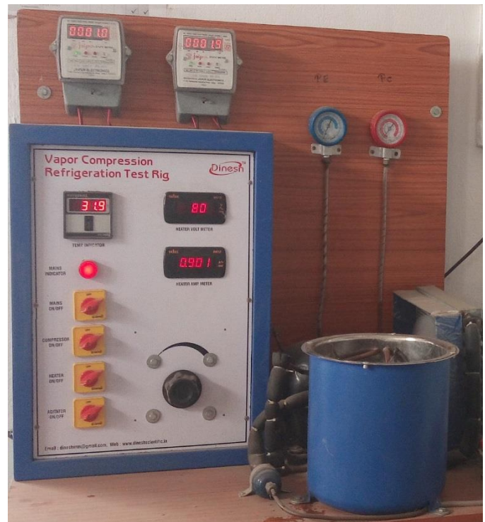
Fig -3: Test Rig of Vapour Compression Refrigeration System with PCM

Display Unit: All the readings of temperature, pressure at various components are measured at the display unit.