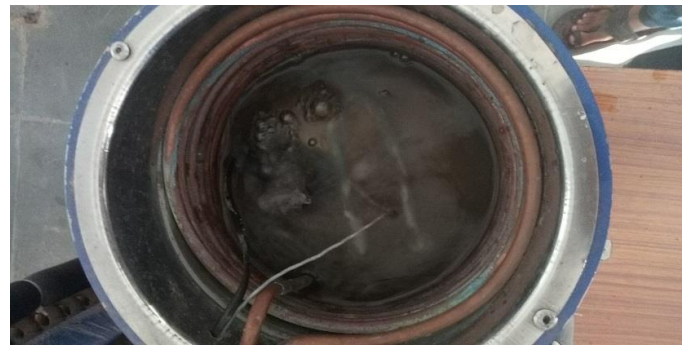
Fig -4: PCM used at Evaporator section