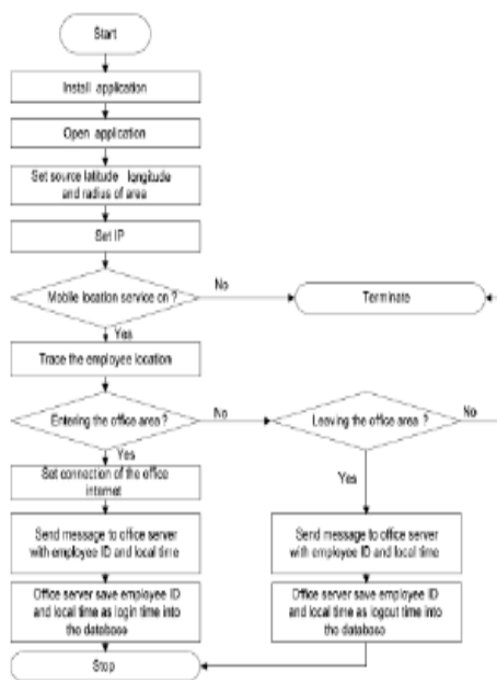
Fig. Flowchart to track the employee.

Employee security and authentication are one among the factors in the current system. Every employee is secured based on their unique user employee identification number. This unique employee identification number is the number which is given in the office to secure their account. The employee identification number along with other information such as location coordinates; images are also saved in the employee's Android device. Firstly the employee has to install the required APK files on their Android mobile. Login by his/her login credentials and takes an image for security purpose. The GPS mobile location service has to be turned on when the system was running for tracking the location. If mobile location service is off then the process won't go to further process and a SMS is sent to turn on the GPS location. The GPS mobile location service helps to track the employee longitude and latitude positions. When the employee enters the working area, the Android device of the employee it should be referred to through the internet access or any WIFI and a SMS is sent to the server which is present in the office, with the employee identification number and local time of the android device which is referred as login time of that employee. When an employee leaves the working place, a SMS is sent to the office computer with employee id and local time which is referred as logout time and for security purpose, an image is taken to secure the account.