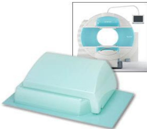
Fig:View of a green housing and medical imaging system [2]

Application name Housing, lawnmower, Husqvarna Industry House / Garden Manufacturer Husqvarna Material name Luran® S Material abbreviation ASA 20