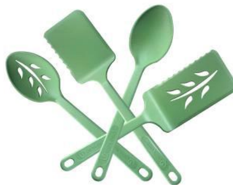
Figure 2. View of several green kitchen utensils [2]

Application name Kitchen utensils, Green Street™ IndustryHouse / Garden Manufacturer Robinson Home Products Material name Valox IQ Material abbreviation PBT