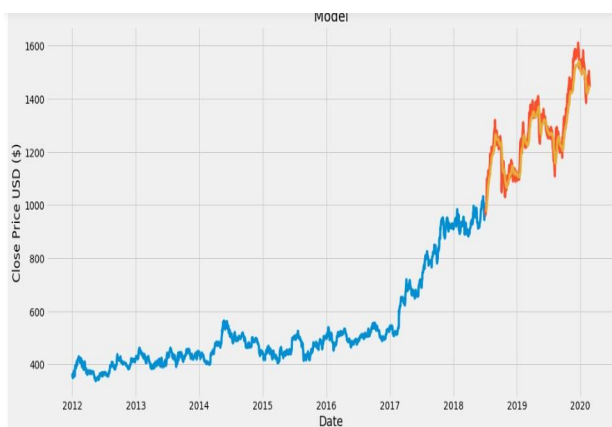
Fig 3. Historic data, Train data and Predicted data

In the future, the stock market prediction system can be further improved by utilizing a much bigger dataset than the one being utilized currently. This would help to increase the accuracy of our prediction models. Furthermore, other models of Machine Learning could also be studied to check for the accuracy rate resulted by them.