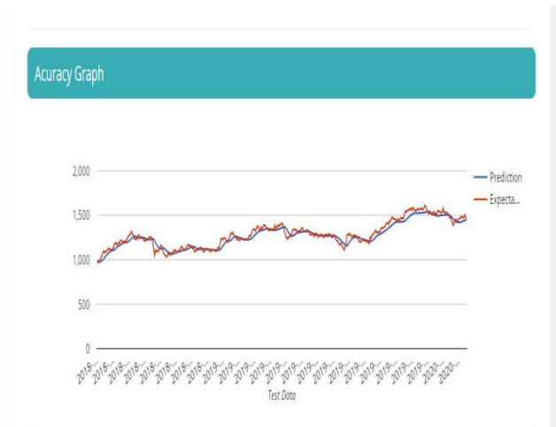
Fig 4. Accuracy vs Test data graph