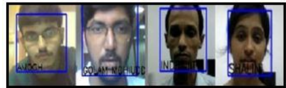
Fig.7. Recognized Faces.

On these trimmed countenances, the student calculation is raced to make it prepared for face acknowledgment. Presently, the procedure of face acknowledgment is performed utilizing Eigenfaces and LBPH calculations. The outcomes for it utilizing Eigenfaces is shown in fig. what's more, that utilizing LBPH calculation is appeared in fig.7.