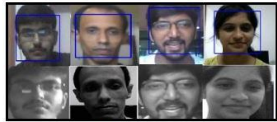
Fig.6. Cropping detected faces.

The process of face detection was performed using still images and video recordings. Next, the face regions from the detected faces are cropped and stored in a folder on the hard drive as grayscale images as is shown in fig.6.