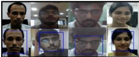
Fig.5. Face Detection in various poses.

The analysis was performed utilizing Python IDLE 3.7 on Windows 8.1 working framework running on Intel Pentium fifth gen processor. The processor recurrence was 2.2 GHZ. SQLite 3 database was utilized for putting away data. The main column in fig. 5 shows pictures of a face from different edges. The accompanying column demonstrates that the pictures have been recognized precisely.