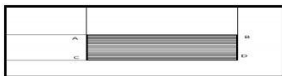
Fig.1. Integral image

where A,B,C,D are a piece of the fundamental picture I appeared in Fig. 1. Contingent on the definition, each Haar-like component may require more than 4 inquiries. To distinguish an article, three kinds of rectangular highlights viz. Lines, Edges and blends of four square shapes are utilized by