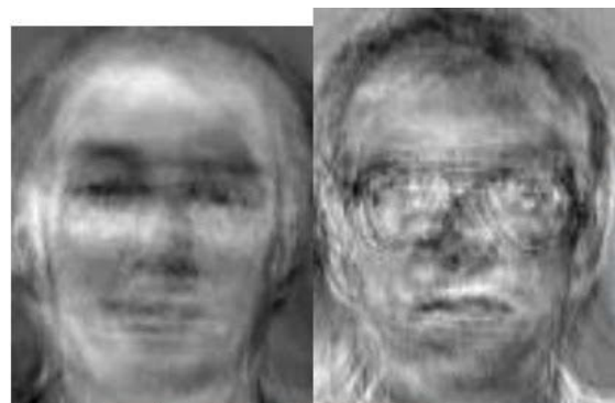
First three Eigen faces: