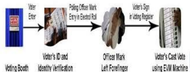
Fig.1 Existing Voting Process scenario

In the current voting system, [3] the ballot machines where used in which the symbols of various political parties are displayed. When we press the button with the respective party's (political party) symbol the voting is done. The chance of fake person casting their vote is more in the existing system. The voting person may use the fake voting card and cast his vote, this may cause problem. In the existing system, the person has to travel long places to his constituency to cast his vote. Therefore, we need an effective method to identify the fake voters during voting. So, the