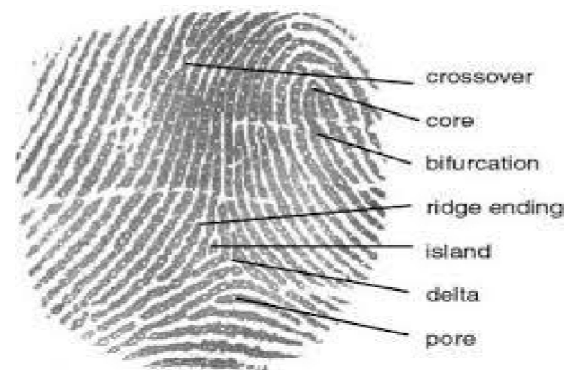
Fig 5 Fingerprint

A fingerprint is an impression of the friction ridges of all or any part of finger. The method of fingerprinting is a type of biometric recognition mainly used for identifying the applications of internet. This method is leading one of low cost and unique, can't be changed easily and the stealing and losses are not possible.