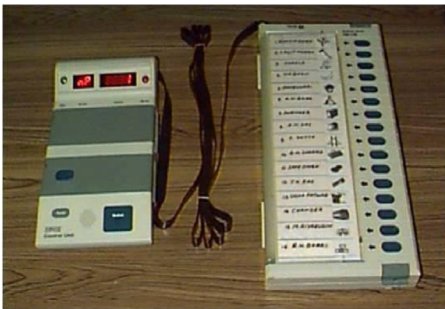
Fig 1: Electronic Voting Machine

Due to the low voltage, there is absolutely no risk of any voter getting a shock. presently, it can record a maximum of nearly 4000 votes, which is equally for a election booth as they typically have no more than 1400 voters assigned. At present, an EVM can furnish to a maximum of candidates. There is specialty for sixteen candidates in a polling Unit. If the total number exceeds, a second Unit can be linked equivalent to the first Balloting Unit and so on till a maximum of 4 units. The conventional method of polling is used if the number of candidates exceeds 64.