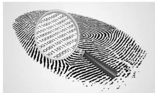
Fig 6 Digital reading of fingerprint

Modern fingerprint methodology, aided by central processing unit and laser machinery, these methods can speed the process of matching, and it gives a mammoth comparative specimens with database. The method of digital fingerprint reading and its techniques are explained above.