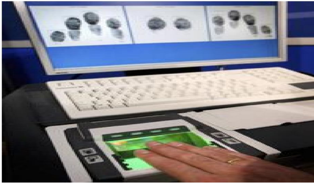
Fig 7 Digital scanning of fingerprint