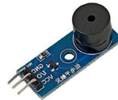
Fig 6: Buzzer sensor

The active buzzer makes sounds when triggered. It operates with 5VDC. You can use any of the Arduino IOs to control this module. It makes sounds when IO connected is HIGH. You can remove the label on the top to make the sounds louder.