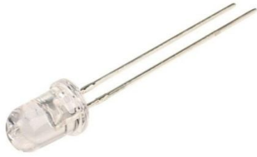
Fig 8: LED

LED is the acronym for “Light Emitting Diode”. LEDs are semiconductor devices that produce light. These were initially used as indicator lights but are now used extensively for indoor and outdoor lighting.