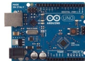
Fig 2: Arduino UNO

The Arduino Uno is a microcontroller board based on a removable, dual-inline-package (DIP) ATmega328 AVR microcontroller. It has 20 digital input/output pins (of which 6 can be used as PWM outputs and 6 can be used as analog inputs). Programs can be loaded on to it from the easy-to-use Arduino computer program.