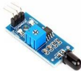
Fig 4: Flame sensor

A flame-sensor is one kind of detector which is mainly designed for detecting as well as responding to the occurrence of a fire or flame. The response of these sensors is faster as well as more accurate. This sensor uses the infrared flame flash method, which allows the sensor to work through a coating of oil, dust, water vapor, ice.