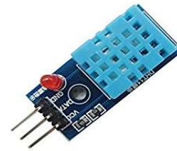
Fig 5: DHT11 Temperature and Humidity sensor

DHT11 is a low-cost digital sensor for sensing temperature and humidity. This sensor can be easily interfaced with any micro-controller such as Arduino, Raspberry Pi etc., to measure humidity and temperature instantaneously. DHT11 is a relative humidity sensor.