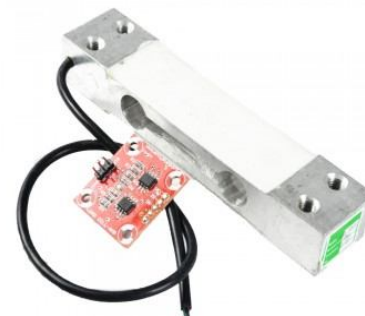
Fig 7: Load cell

A load cell is a type of transducer, specifically a force transducer. It converts a force such as tension, compression, pressure, or torque into an electrical signal that can be measured and standardized. As the force applied to the load cell increases, the electrical signal changes proportionally.