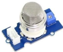
Fig 3: MQ5 Gas sensor

The Gas Sensor (MQ5) module is useful for gas leakage detection (in home and industry). It is suitable for detecting H 2 , LPG, CH 4 , CO, Alcohol. Due to its high sensitivity and fast response time, measurements can be taken as soon as possible.