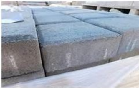
Fig -3: Marble dust Concrete Cube