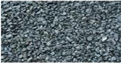
Fig-4: Crushed granite