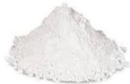
Fig -2: Marble dust Powder available in processing plant

Marble dust used in this project was procured from marble Processing plant in Malegaon. These dust are very harmful for human health as well as animal and plants. With the use of these waste main in Malegaon. the quantity of waste material can be minimize. Hence it is a waste optimization technique. With the replacement of cement by marble dust powder we can achieve a greener construction. Fig 2 shows marble dust powder available in processing plant Whereas the fig. 3 shoes concrete cube manufacture by replacement of cement with dust and fig 4 shows the crushed granite which is used in this study.