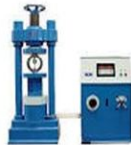
Fig-1: Compression Test Machine