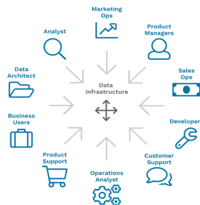
Fig-2 Economic Growth and Development of Big Data Cloud

While distributed computing developed somewhat sooner than Big Data, it is another figuring worldview for conveying calculation as a fifth utility (after water, power, gas and communication) with the highlights of flexibility, pooled assets, on-request get to, self-administration and pay-as-you-go (Mell and Grance 2011) [23].