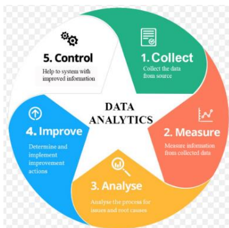
Fig-1 Big Data Analytics

Big Data analytics is an emerging research topic with the availability of massive storage and computing capabilities offered by advanced and scalable computing infrastructures. Having data is not sufficient for sustainable development; the hidden beauty of big data is the analytics. There are many big data analytics engines that take care of the variety of big data for sustainable development. Baumann et al. (2006) introduced the EarthServer, a Big Earth Data Analytics engine, for coverage-type datasets based on high performance array database technology, and interoperable standards for service interaction. The EarthServer provided a comprehensive solution from query languages to mobile access and visualization of Big Earth Data [14].