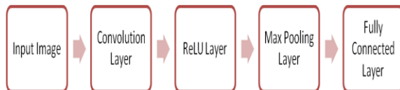
Fig 2 CNN architecture

They have applications in image and video recognition, recommender systems and natural language processing. A CNN consists of an input and an output layer, as well as multiple hidden layers. The hidden layers of a CNN typically consist of convolutional layers, pooling layers, fully connected layers and normalization layers. Description of the process as a convolution in neural networks is by convention. Mathematically it is a cross-correlation rather than a convolution. This only has significance for the indices in the matrix, and thus which weights are placed at which index.