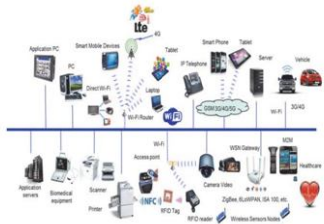
Figure 3: IoT IP coverage [34]

This section aims to provide a guideline for research to select the right communication protocol by providing a comparison between the above mentioned communication protocols. Different criteria are used to benchmark the differences between the communication protocols. Such criteria include standard, network, topology, power, range, cryptography, spreading, modulation type, coexistence mechanism, security and power consumption as shown in IoT IP coverage in Figure 3 and Table 1.