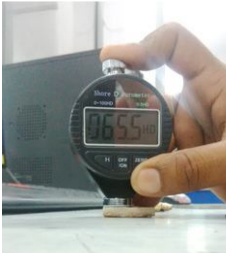
Figure 1: While performing Shore D hardness Test