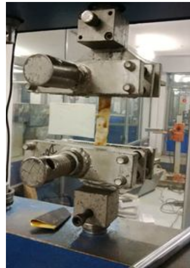
Figure 6: Sample during Tensile Test