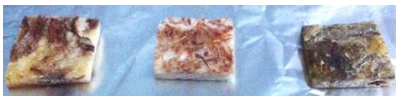
Figure 2: Specimen as per the ASTM standards for Shore D Hardness Test