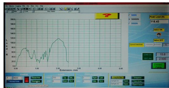
Figure 7: Graph between Extensions per mm vs Load for Composite with Sugarcane Husk