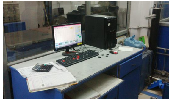
Figure 9: Workstation at Spectro for tensile testing machine