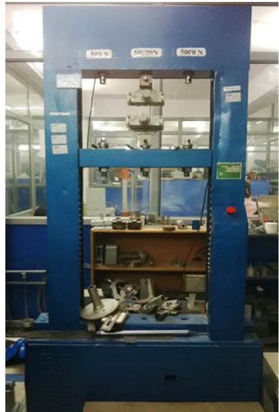
Figure 3: Ultimate Tensile Strength Machine

One of the properties can determine about a material is its ultimate tensile strength (UTS). This is the maximum load the specimen sustains during the test. The UTS may or may not equate to the strength at break. This all depends on what type of material is testing . . . brittle, ductile or a substance that even exhibits both properties. And sometimes a material may be ductile when tested in a lab, but, when placed in service and exposed to extreme cold temperatures; it may transition to brittle behavior.