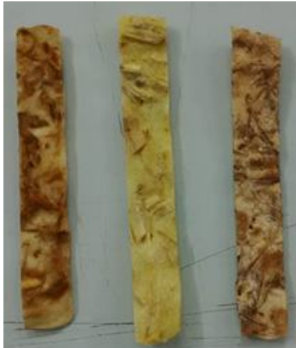
Figure 4: Samples as per the ASTM standards

Specimen size: The most common specimen for ASTM D-638 is a Type “I” tensile bar but test was performed on 20x100x4mm rectangular bar because further machining on sample could lead to sample failure.