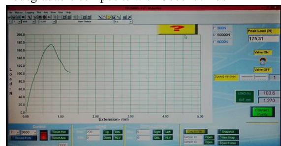
Figure 8: Graph between Extensions per mm vs. Load for composite with Coconut fibers in it