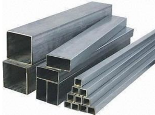
Fig. Square bar

The chassis is fabricated from Plywood sheet. This is done for ease of fabrication, and to reduce the overall weight. The chassis was designed to take a static load of 3kg. The flange which holds the motor was designed using Aluminium and is bolted to the chassis. So that the driving motors can easily accommodate below the chassis. The chassis incorporates hole for attaching front globe wheel, and also for attaching the lift structure.