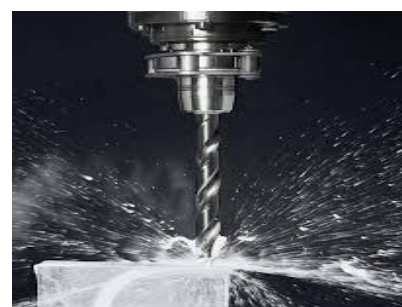
Figure No: 1.1Experimental setup

machines that are capable of achieving high accuracy and very low processing time [2] The quality of the surface plays a very important role in the performance of dry drilling because a good quality drilled surface surely improves fatigue strength, corrosion resistance and creep life. Surface roughness also effects on some functional attributes of parts, such as, contact causing surface friction, wearing, light reflection, ability of distributing and also holding a lubricant, load bearing capacity, coating and resisting fatigue. As we know in actual machining, there are many factors which affect the surface roughness i.e. cutting conditions, tool variables and work piece variables. Cutting conditions include speed, feed and depth of cut and also tool variables include tool material, nose radius, rake angle, cutting edge geometry, tool vibration, tool overhang, tool point angle etc. and work piece variable include hardness of material and mechanical properties. It is very difficult to take all the parameters that control the surface roughness for a particular manufacturing process. Drilling is a cutting process that uses a drill bit to cut or enlarge a hole of circular cross-section in solid materials. The drill bit is a rotary cutting tool, often multipoint. The bit is pressed against the work piece and rotated at rates from hundreds to thousands of revolutions per minute. This forces the cutting edge against the work piece, cutting off chips from the hole as it is drilled.