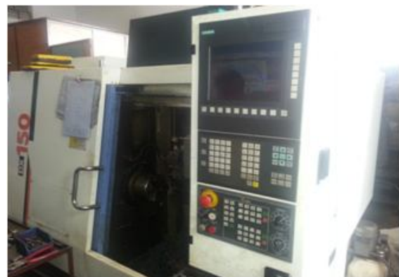
Figure No: 2.1 Experimental setup

Drilling tests are performed on DECKEL MAHO-DMC 835V (continues speed up to 14000rpm and 14kw spindle power) CNC machining center using HSS spiral type drill bits. To guarantee the initial conditions of each test, a new drill tool is used in each experiment. The work piece is of 41Cr4 Material the experimental setup is shown figure No: 2.1