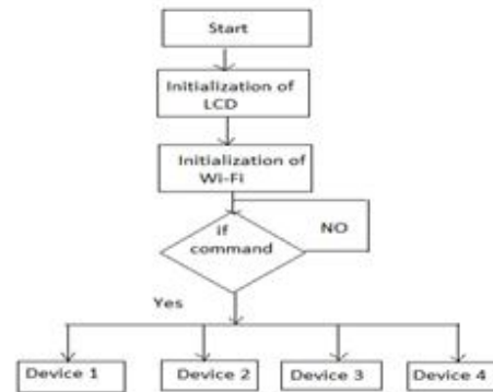
Fig 4:- Workflow of Proposed System