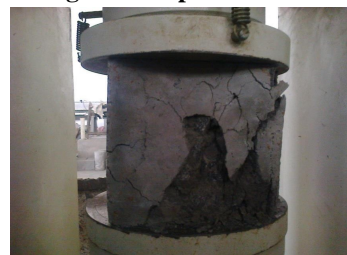
Fig 1.1 Compression Test

Cubes must be cured before they are tested. Unless required for the test at 24 hours, the cube should be placed immediately after demoulding in the curing tank or mist room. If curing is in a mist room the relative humidity should be maintained at no less than 95%. Curing should be contained as long as possible up to the time of testing.