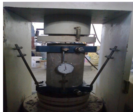
Fig 1.2 Split Tensile Test

The test cylinder was attached with a longitudinal compress meter to measure compressive strain over middle 2/3 of the specimen (gauge length = 200mm). Four cycles of loading and unloading was done, the cycles were continued till the percentage difference between two consecutive cycles was less than 5%. The modulus of elasticity was found out by plotting the stress-strain curve. The modulus of elasticity was obtained with reference to tangent modulus. The experimental set up for the compressive strain measurements on HSC cylinder specimen.