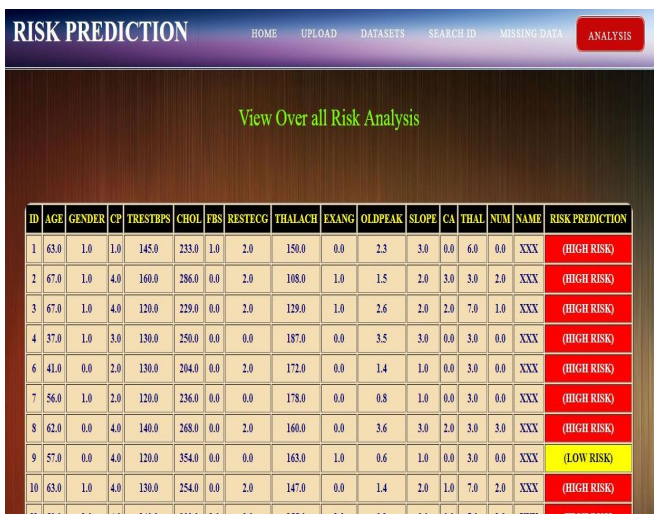
FIG 4:. Shows the overall analysis of users

Admin of the website also can check the all users prediction results and they may send alerts to the patients. Figure 4 shows the overall results of all users.