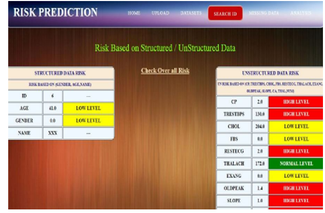
Fig 3: Model of predicting the results

The heart is important organ of human body part. It is nothing more than a pump, which pumps blood through the body. If circulation of blood in body is inefficient the organs like brain suffer and if heart stops working altogether, death occurs within minutes. Life is completely dependent on efficient working of the heart. The term Heart disease refers to disease of heart & blood vessel system within it. To analyze the results the user has to login in to the website, if user is not register then register first and the login into the system. After that user has to enter the values to attributes displayed on the screen. After entering the values, user can analyze their health condition for each and every attribute results, that refers to the heart disease chances are high or low. The figure 3: shows the result models.