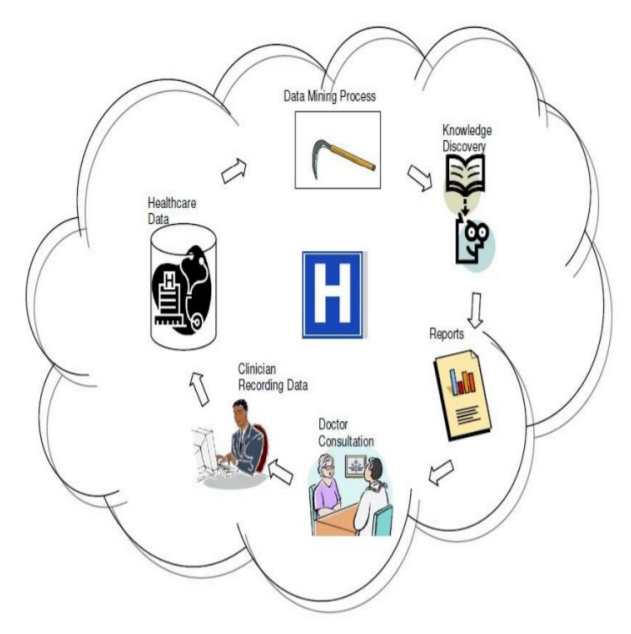
Fig: 2 illustrating the working process of the system

The main role of this research is to develop a prototype Intelligent Heart Disease Prediction System (IHDPS) using three data mining modeling techniques, namely, Decision Trees, Naïve Bayes and Neural Network.