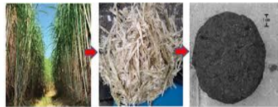
Fig:1 Formation of Bagasse ash