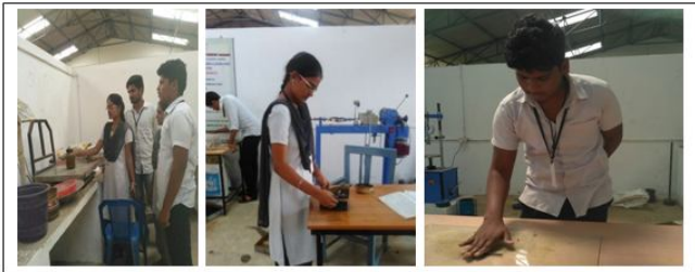
Fig:2 Specific Gravity, Liquid Limit and Plastic Limit Tests