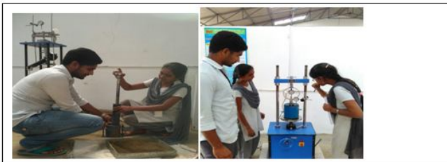
Fig:3 Compaction equipment and CBR test