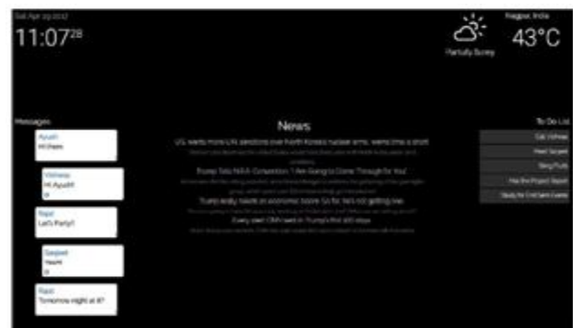
Figure 3: The Mirror interface which will display various notifications, messages, ToDo lists, etc.

Change settings & get status information.