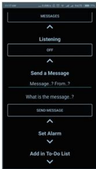
Figure 4: Screenshot of the Android Application to control the Mirror and provide voice input