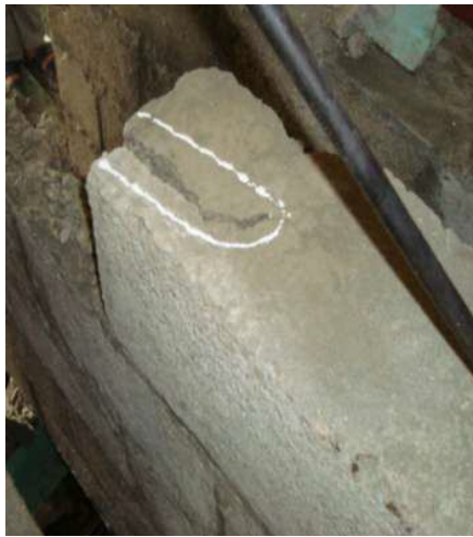
Figure 1. Crack in concrete block wall.