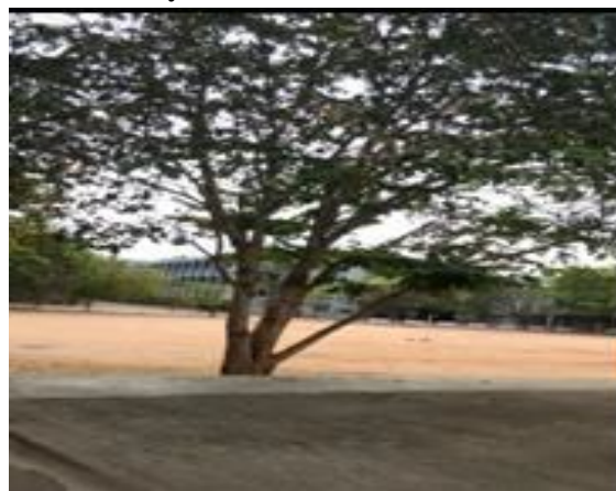
Plate 1: Study Area

Tamil Nadu is one of the 28 states in India. Its capital is Chennai (Formerly known as Madras) the largest city. Tamil Nadu lies in the southern most part of the Indian peninsula and is bordered by the union territory of puducherry and the states of Kerala, Karnataka and Andhra Pradesh. Coimbatore is the city in Tamil Nadu, South India. It is the capital city kongunadu region and is often been referred to as the Manchester of South India. The Nirmala College is situated in the district of Coimbatore, which has a pleasant climate due to the presence of forests to the north and the cool winds blowing through the Palghat gap in the Western Ghats. The College campus is pollution free and eco-friendly. It is filled with more number of medicinal trees and has a rich Botanical Garden.