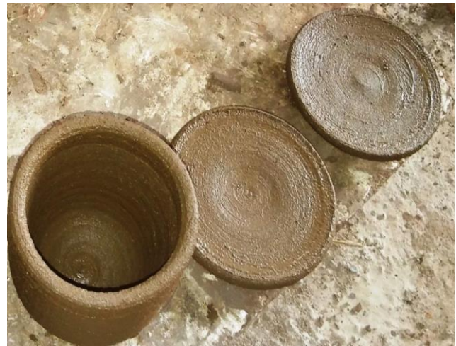
Fig.disc & candle of tulsi & neem powder