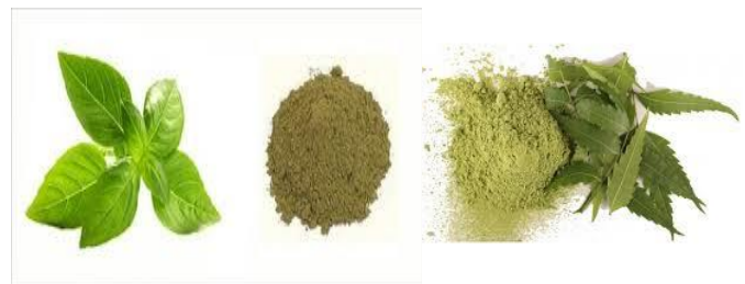
Fig: Material form of Neem and Tulsi

Water free from suspended solids need to be used. Although, purity of the water used for mixing will not have much effect.