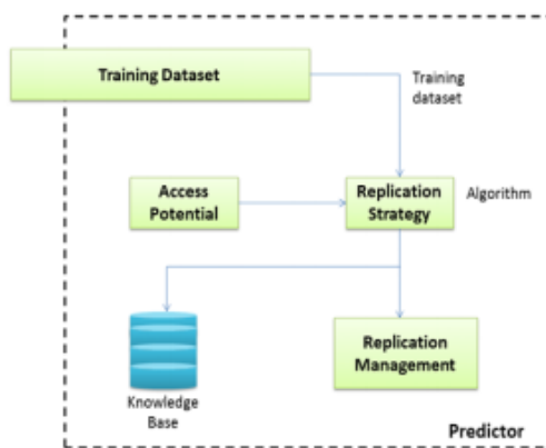
Fig. Predictor System

New replication factor denote the final replication factor of that particular file. using this methodology, the replication factor for all existing file is calculated and store it within the metadata.