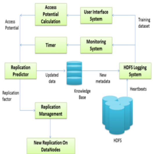
Fig. Architecture of System