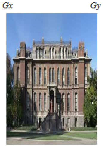
Fig (1) Original Image