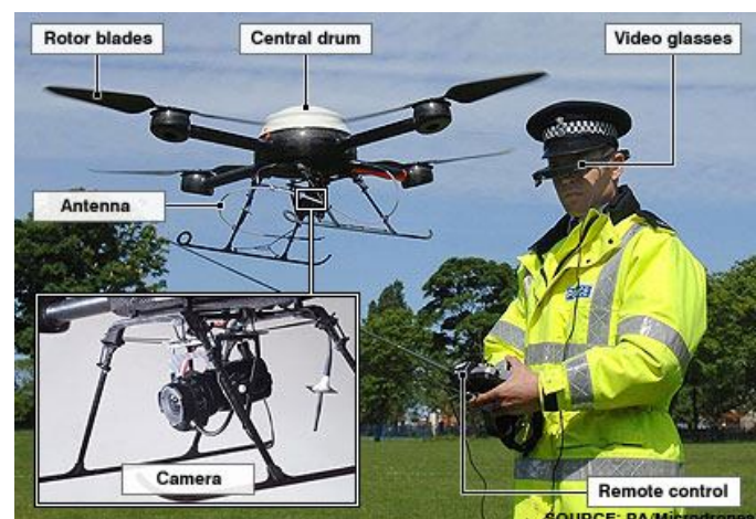
Fig. 7 SURVEILLANCE UAVs

Privacy law has not kept up with the rapid pace of drone technology, and police may believe they can use drones to spy on citizens with no warrant or legal process whatsoever. Several bills are currently going through Congress, which attempt to provide privacy protections to Americans who may be caught up in drone surveillance. As the numbers of entities authorized to fly drones accelerates in the coming years—the FAA estimates as many as 30,000 drones could be flying in US skies by 2020—EFF will continue to push for transparency in the drone authorization process and work to ensure the privacy of all Americans is protected.