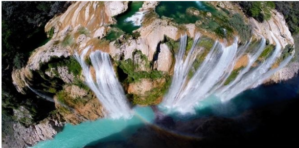
Fig. 8 TAMUL WATERFALL PIC FROM A UAV

Several macros are integrated into the mdCockpit application software, which take away much of the effort in planning a mapping job. Using a particular macro, the flight path over a specific area can be generated automatically