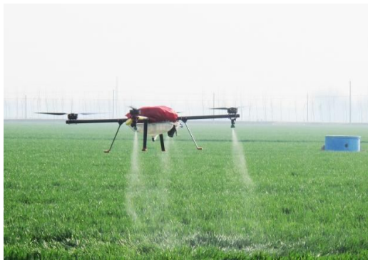
Fig. 6 AGRICULTURAL UAVs

As an added safety net with the flip of switch your Precision Drone will return to its original takeoff location