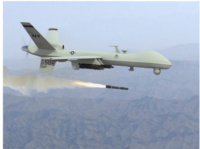
Fig. 9 WAR-FARE UAV