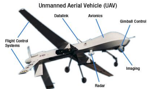
Fig. 1 Model of UAV

Unmanned Air Vehicles (UAVs) play a predominant role in the modern day warfare where emphasis is on surveillance, intelligence-gathering and dissemination of information. Within a few decades, these systems have evolved from performing a single role/mission to performing multiple missions like surveillance, monitoring, acquiring, tracking and destruction of target with the use of advanced technologies. UAVs serve as unique tools, which broaden battlefield situational awareness and the lowest tactical levels. A distinct advantage of UAVs is their cost-effectiveness. They can be developed, produced, and operated at lower costs compared to the cost of manned aircraft. The relative savings in engines, airframes, fuel consumption, pilot training, logistics, and maintenance are enormous. The biggest advantage of UAVs, however, is that there is no risk to human lives. Unmanned platforms are the emerging lethal and non-lethal weapons of choice and have transformed the way the armed forces now prosecute operations. The probability of losing reconnaissance platforms to enemy fire is quite higher, thus making UAV a better option. UAVs are mainly used by an organization for aerial maps and photography. They are also used in the military as weapon carrier and secret war attack.