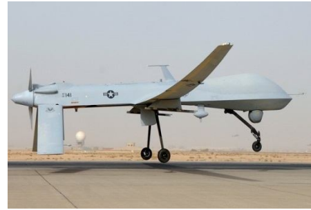
Fig. 5 RQ-1 PREDATOR

The RQ-1 Predator, probably the best-known modern UAV, made its first test flight in 1994. Produced by General Atomics Aeronautical Systems—based on a design by Abraham Karem, a former engineering officer for the Israeli Air Force—it was designed for “long loiter” reconnaissance work. The RQ-1 has evolved, and today its variants patrol the U.S.-Mexico border, collect air samples for scientific research, and unleash Hellfire air-to-ground missiles on military targets.