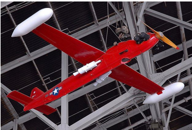
Fig. 4 FIRST RECONNAISSANCE DRONE

Reginald Denny’s Radioplane Company, which was acquired in 1952 by Northrop Aircraft Incorporated, led the way in post-World War II UAV development. While most of the drones designed and produced during this period were used for target practice, 1955 saw the U.S. Army’s first reconnaissance drone, the Northrop Radioplane RP-71 Falconer (designated the SD-1 by the Army), based on a target vehicle design. Launched by two rockets and recovered by parachute, the Falconer carried a still film camera and could transmit crude video.