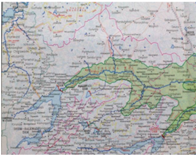
Fig 1. Map of Wai taluka