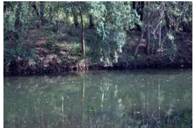
Fig, 3. Bhogaon

water from selected points, immediately DO fixation will be done to maintain the parameters of river water till reaching laboratory. Location will be properly marked on cans to avoid mistakes. As mentioned in methodology various parameters to be tested in laboratory as per American Public Health Association (APHA) standards. On the basis of lab test results, contamination will be discussed further. Following are some images of collection points.