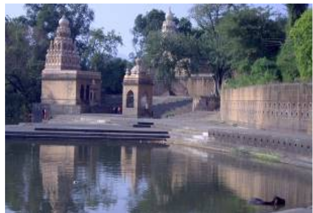
Fig. 4. Menawali