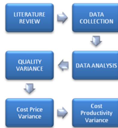
Fig.1 Methodology flow chart