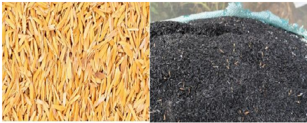
Figure I – Rice Husk And Rice Husk Ash