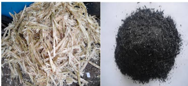
Figure II – Sugarcane Bassage And Sugarcane passage Ash