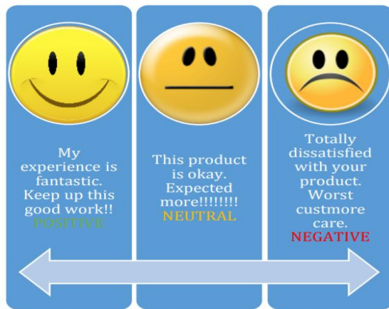
Fig. 1: Sentiment Analysis

Generally, SA entails series of intricate processes. Some tasks surround the study, including subjective analysis, sentiment classification, object or aspect-based extraction, & opinion holder extraction. Subjective analysis entails analyzing text document or phrase to determine if it is subjective or objective. Those documents and phrases labeled as aims are immediately deleted after this stage since they are not of much value for the SA process. Sentiment classification entails determining the polarity of filtered sentences' sentiments. Based on the circumstances, these phrases are classified as positive, negative, or neutral sentiments. A critical task is an aspect or object-based extraction, which is the primary focus element in SA. In certain instances, the task of identifying the opinion holder becomes critical since it is necessary to know the author of view [8].